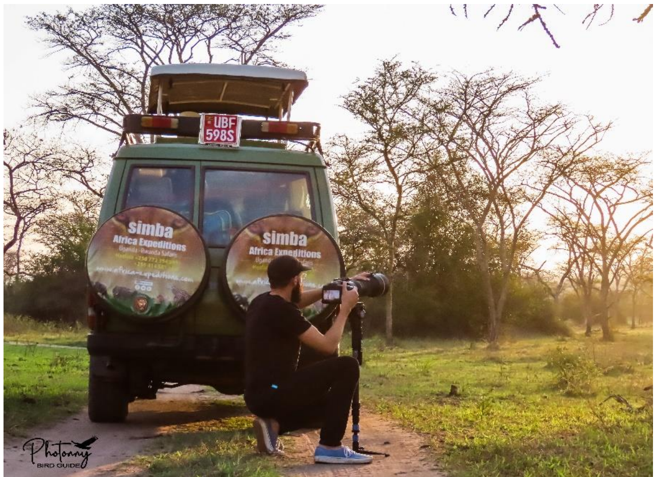
Sun set in Giraffe Track Lake Mburo national park

Located in East Africa, Uganda is a natural beauty, with abundance of gifts bequeathed to her; the snowcapped Rwenzori Mountain, named one of the best hiking