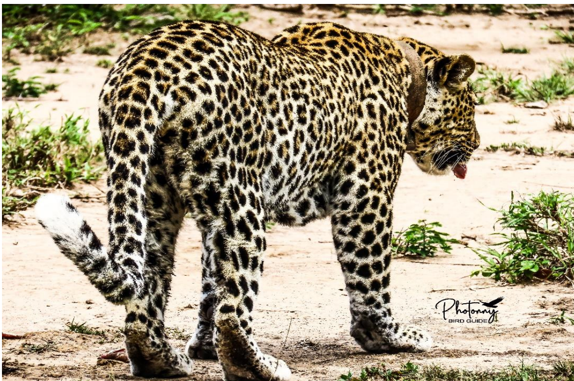
Leopard: in Queen Elizabeth National Park