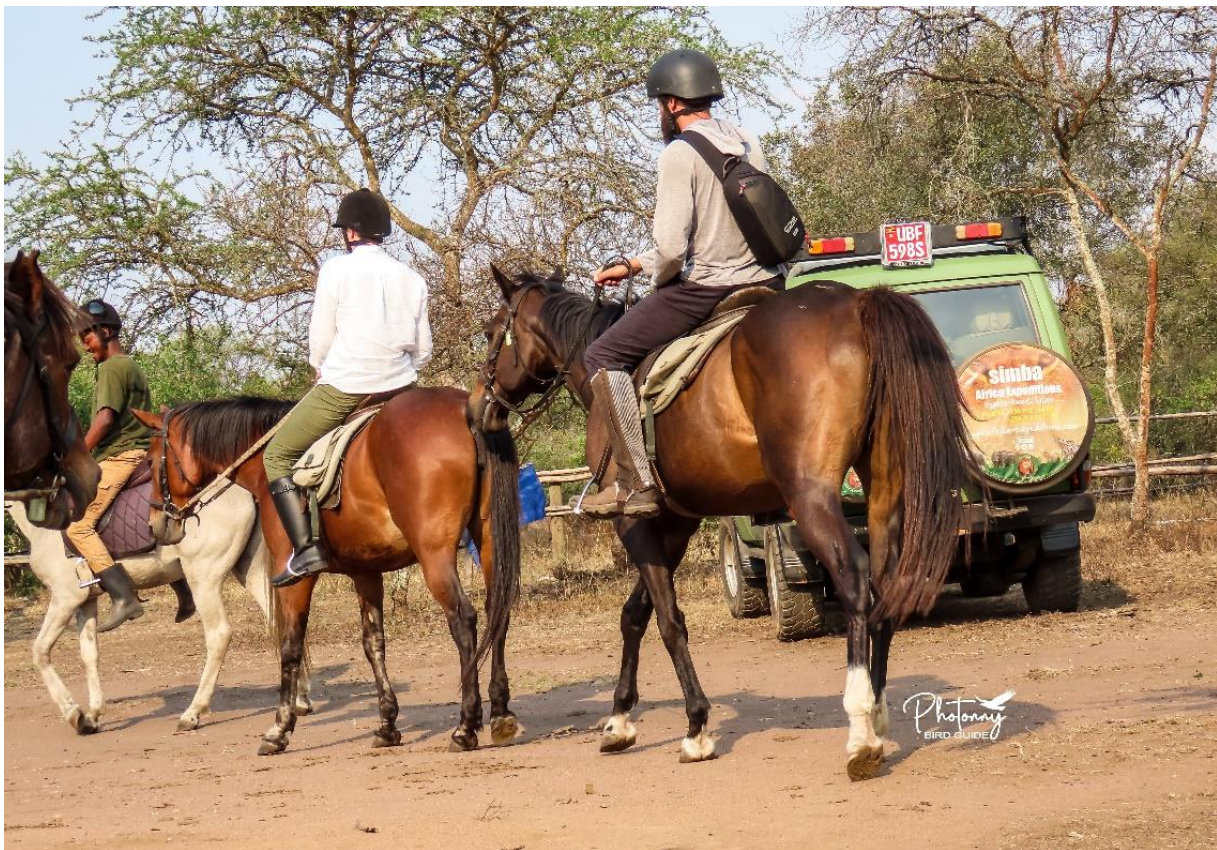
Brandon and Jessica setting off from the starting point

Immediately after lunch, we started our afternoon game drive, while in zebra track, Brandon spotted a stunningly beautiful bright-colored Little Bee-eater and due to its interesting feeding behavior of returning to the same perch after each feeding attempt, it tempted us to park the car for a period of time, set our cameras to capture it flying and landing in that same feeding spot, this indeed worth a stop, continuing with the same track, we came across different dazzles of Zebras and herd of Impalas , since the park was so dry, most of the ponds completely empty, skinny warthogs and waterbucks witnessed staving situation. Connecting to Giraffe track, sun was setting, we luckily saw the giraffes , and several mother Topi with their tinny calves. We returned to the lodge for dinner a little late.