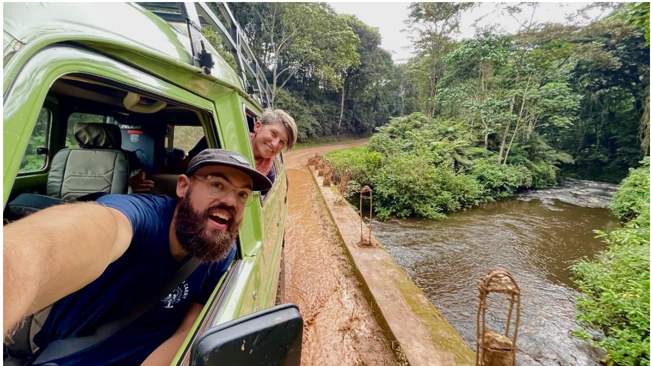
at the bridge in the neck (Bwindi impenetrable forest)

a wide variety of different habitats includes; Mountains, hills, tropical rainforest, woodland, freshwater lakes, swamps and savanna with scattered clumps of trees, were all witnessed by Brandon Alfred, Jessica Ann and I, during the expedition.