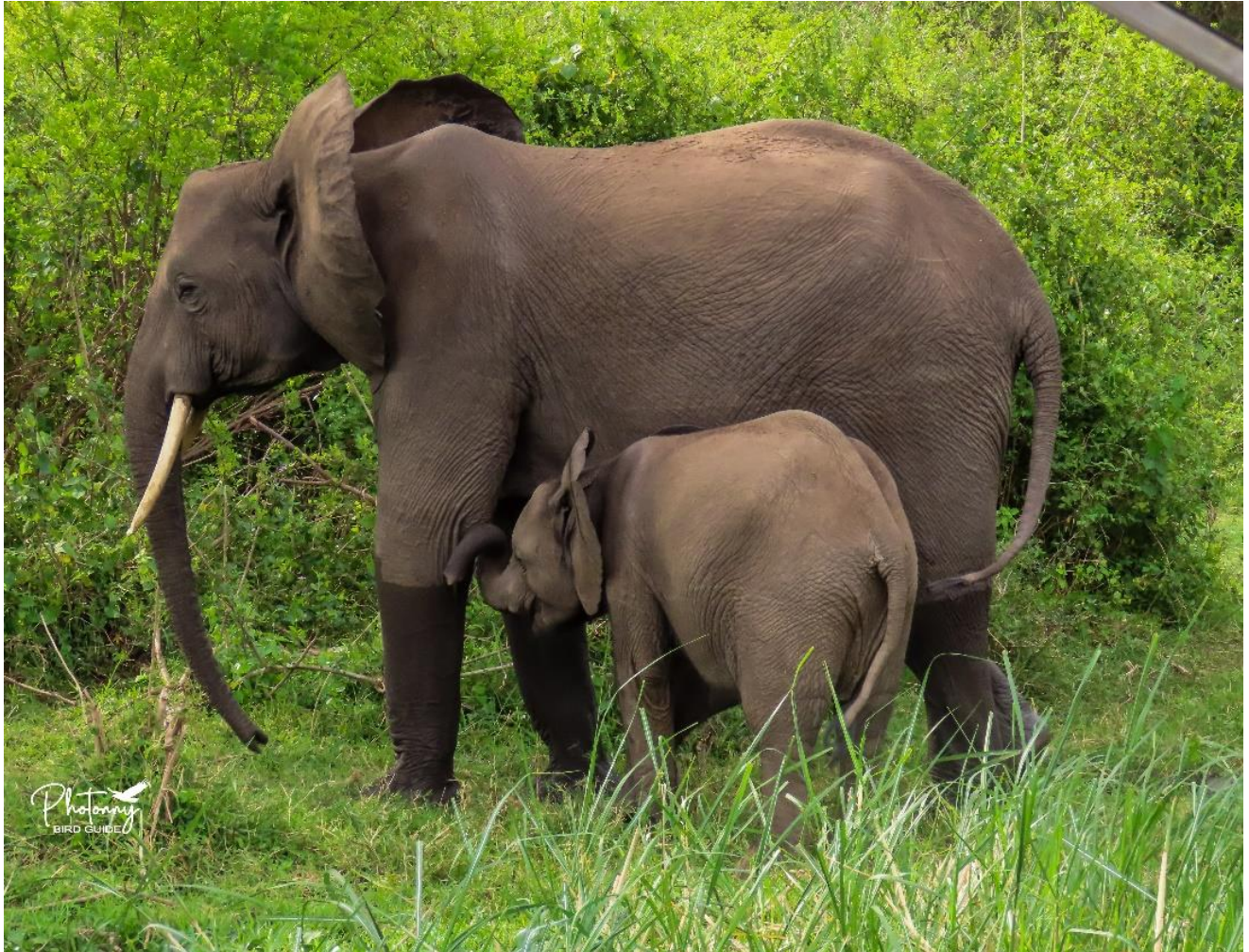
A cow with a little one

Approaching evening, we slowly drove from mweya to the open grasslands of kasenyi which provides the park's primary game viewing areas. A herd of elephants were sighted few kilometers from the lodge, alongside the; warthogs, kobs, and Buffalos in the course of the drive, sunset found us on our way back to mweya lodge.