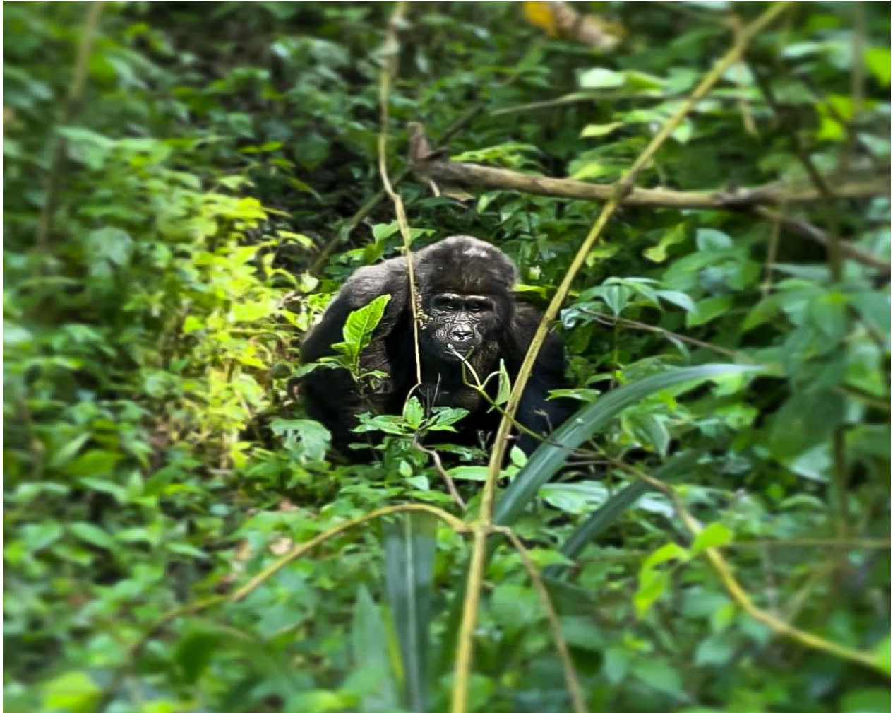
Mishaya family member in Rushaga