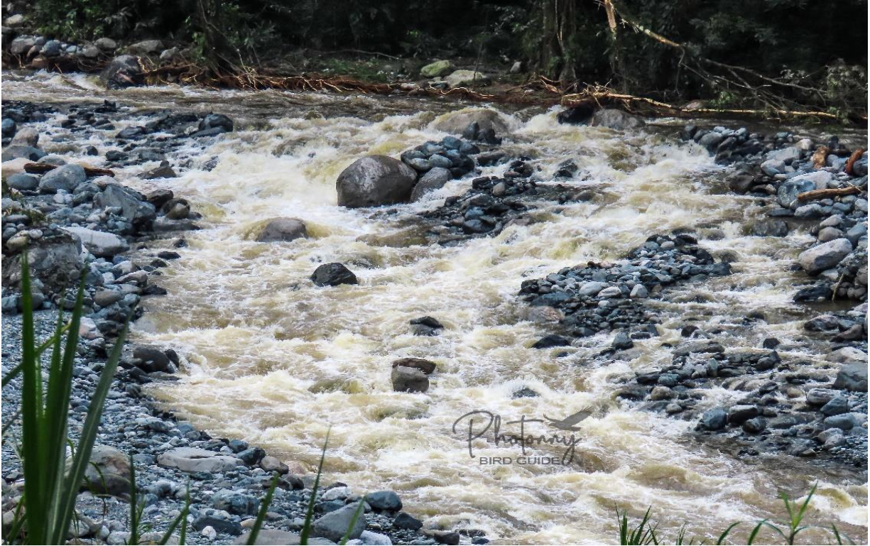
Stream flowing from Rwenzori Mountain