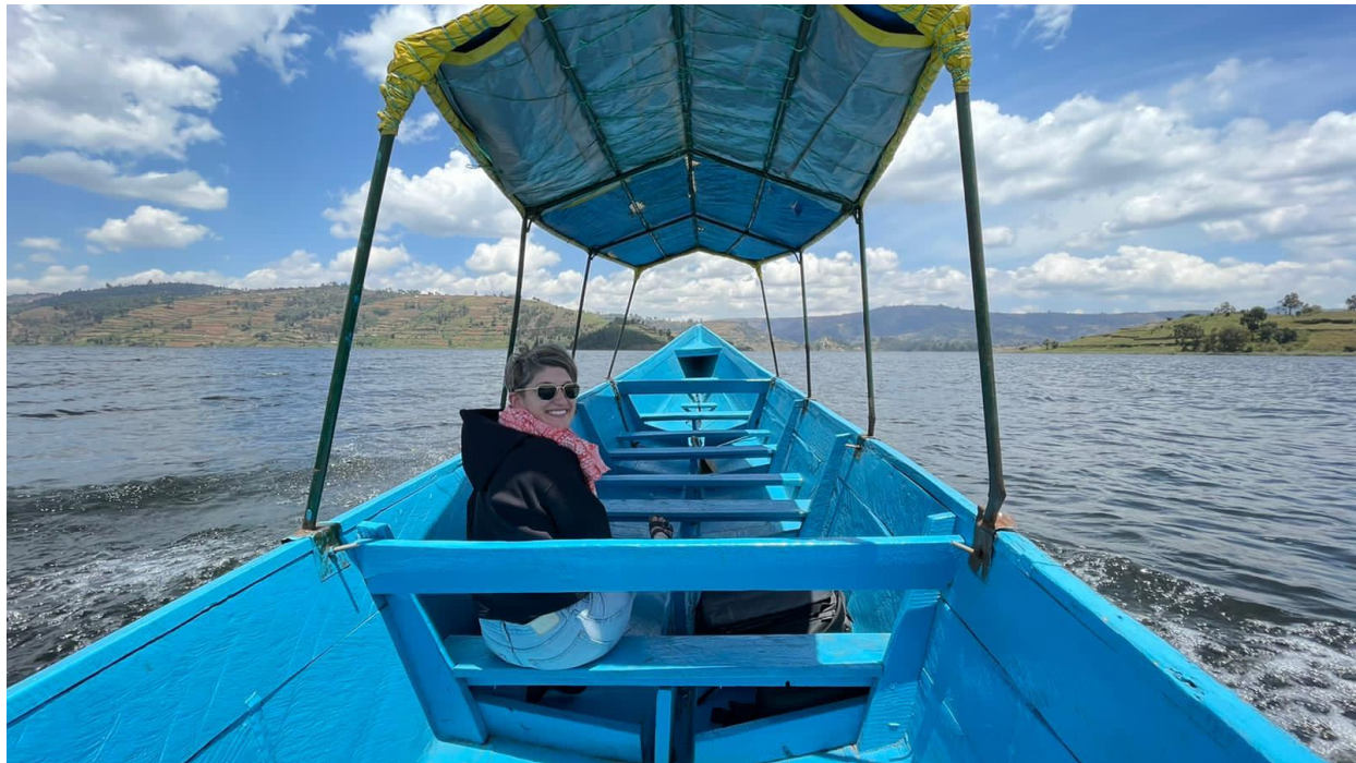
Moto-boat cruising at lake Bunyonyi

located on the shores of the lake Bunyonyi, after checking in the clients, I drove to Kabale (biggest town close to lake bunyonyi) to secure a hotel for myself.