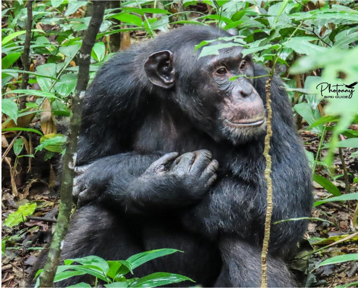
Male Chimpanzee: photographed in kibale forest