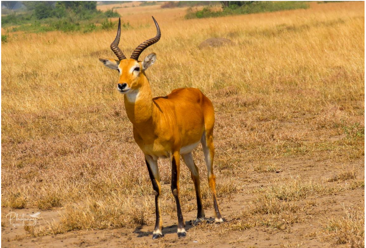
Male kob: Uganda national animal