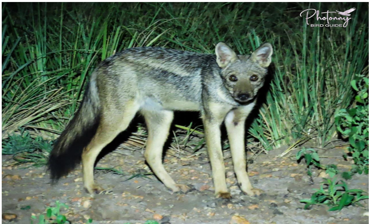
Side-striped Jackal: photographed during night game drive