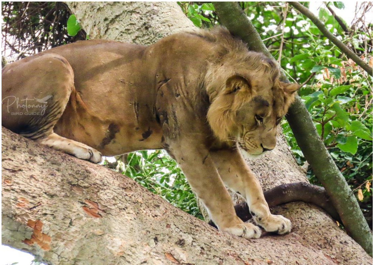
Tree climbing Lion in Ishasha (southern part of Queen Elizabeth National Park)

After lunch, we drove to the park to try our luck, on the tree climbing lions, but the dark clouds that turned the whole day cool, made it very difficult to spot these tree climbing lions since they always climb to hide away from the sun when its hot. The Topi , buffaloes , elephant and kobs were also sighted during this game drive.