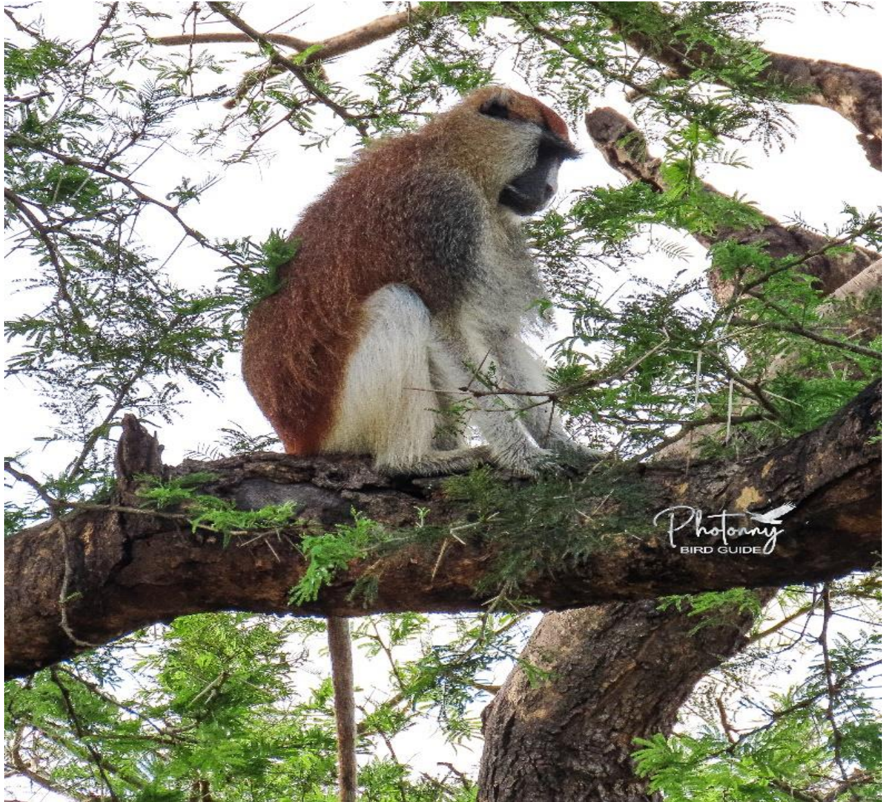
Patas Monkey: photographed in Murchison falls National Park