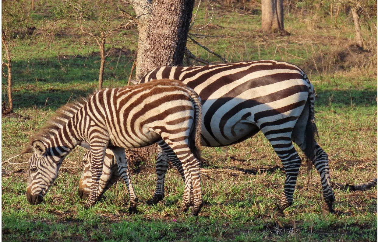
Zebra in lake Mburu National Park