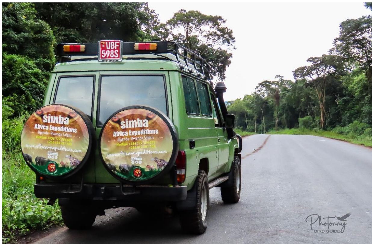
Simba Africa Expedition truck: waiting for client while trekking in kanyio pabidi

seen the previous day, almost reaching the turn to the hippo-pull, many tourist vehicles were sighted in one spot, indicating there was something interesting, reaching there, the leopard was in a roadside tree just close to the track although it wasn't in good views. We didn't spend a lot of time here since Jess (Jessica) wasn't feeling well at all. At this point, we agreed to driving straight to our next destination, and rest for the next morning chimp tracking activity. Using the new bridge, we crossed the Nile to the southern part of the park, and connected to Budongo Eco lodge in Kaniyo pabidi forest, still within the park. We checked-in to the lodge and ate lunch. After, Brandon and Jess went to take a nap, I drove the trackers far away from the lodge to try spotting the chimp in preparations for the next day tracking, unfortunately all guests had missed them that whole day, luckily trackers came back with a smile, meaning they had spotted them nesting, which gave higher chances of seeing them next morning. We summarized the day with dinner and some good news of (Jessica's 50 percent recovery, being able to go for tracking the next day).